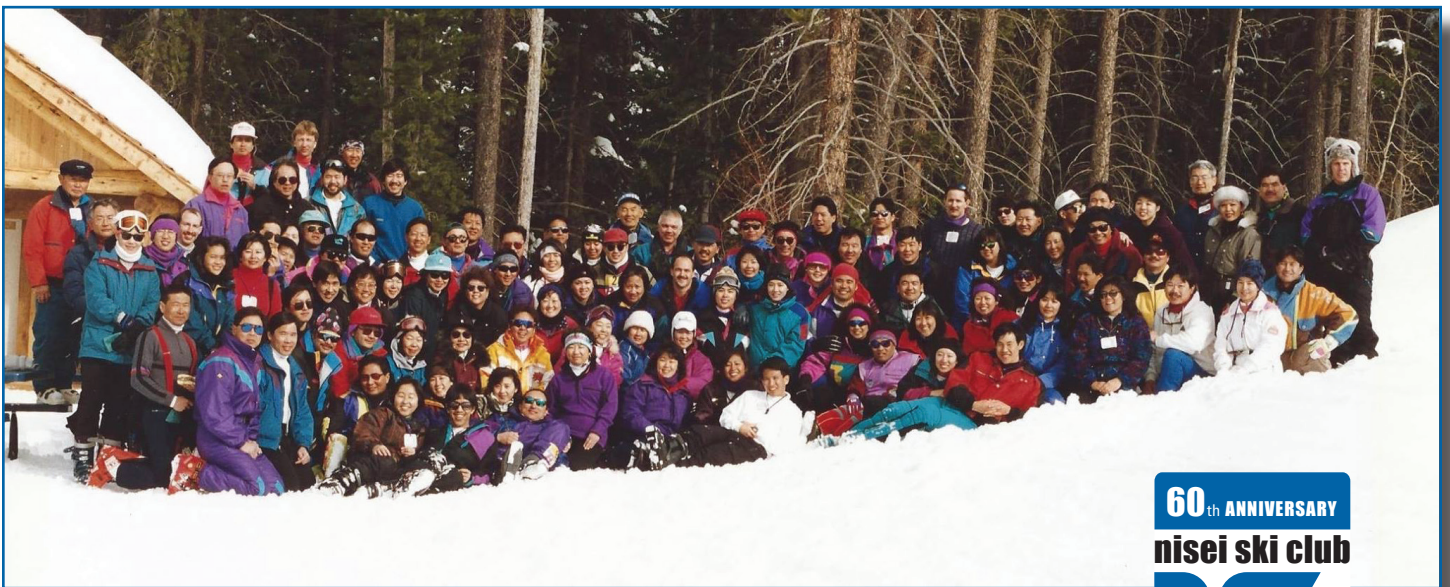
Vail, Colorado 1996