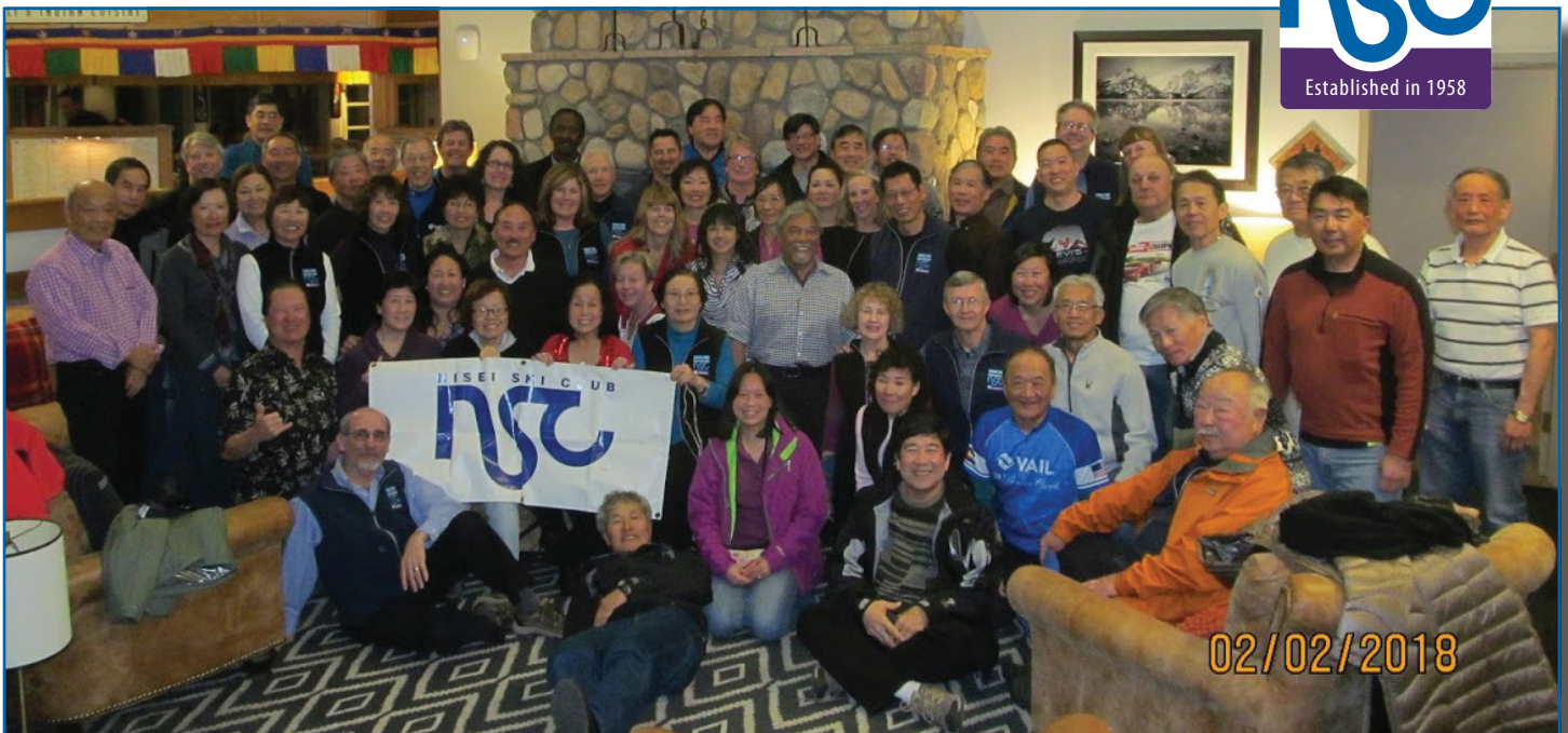
Vail, Colorado 2018